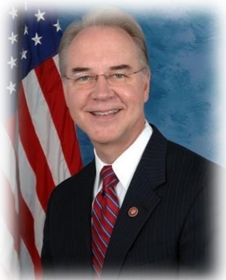
Dr. Tom Price Secretary of the Dept. of Health and Human Services

Tom Price and Seema Verma are the most important health care people in Washington.