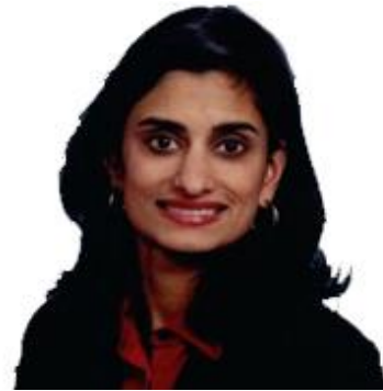
Seema Verma, Administrator of the Centers for Medicare and Medicaid Services